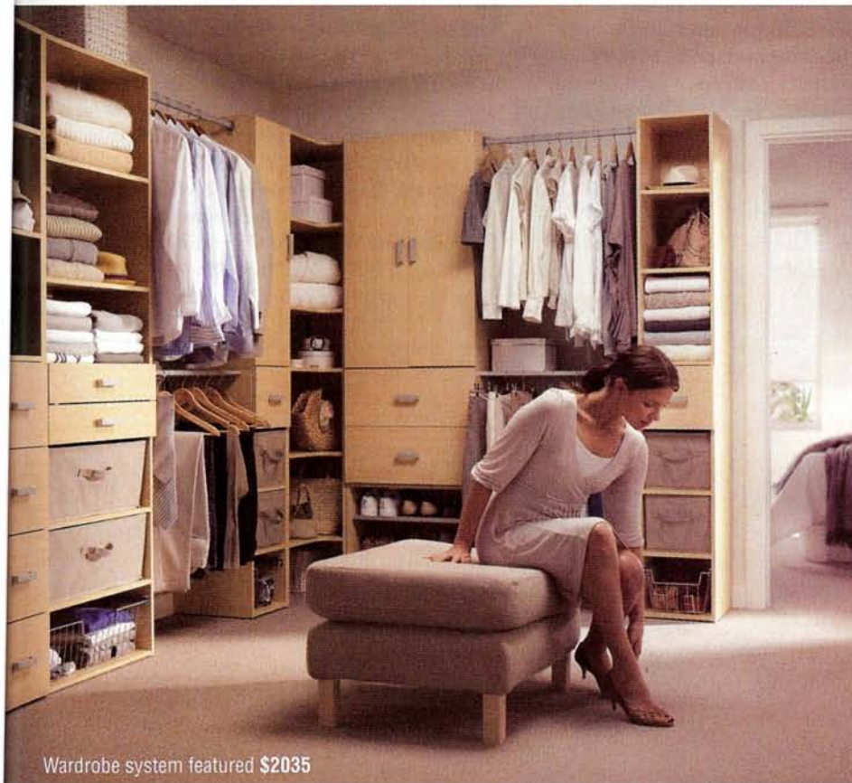
Wardrobe system featured $2035

The three volunteers nod their heads enthusiastically, exit the van. At the prison entrance they are checked by security and then, one by one, they disappear through a doorway, gone to be guests with men who are sinners. ■